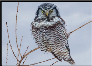
Northern hawk owl