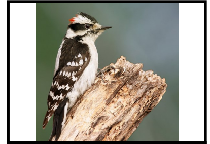
Downy woodpecker Picoides pubescens