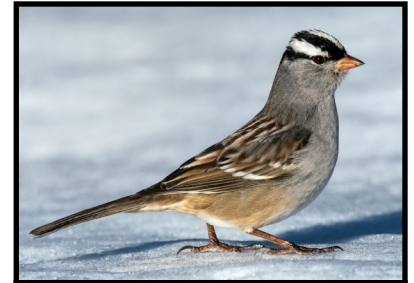
White-crowned sparrow Zonotrichia leucophrys