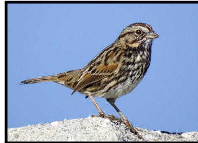
Song sparrow Melospiza melodia

#6 Find the table that is red to spy the bird with a matching colored head.