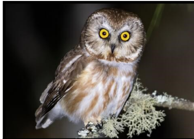
Northern saw-whet owl