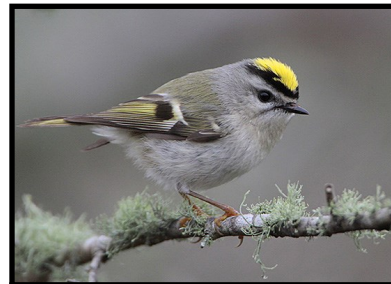
Golden-crowned kinglet Regulus satrapa