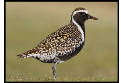
Pacific golden plover