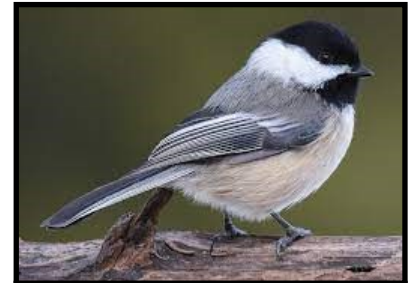
Black-capped chickadee Poecile atricapillus