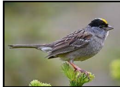
Golden-crowned sparrow Zonotrichia atricapilla