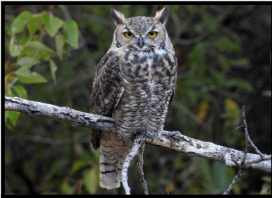
Great horned owl